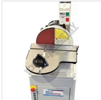
Top View Of Table