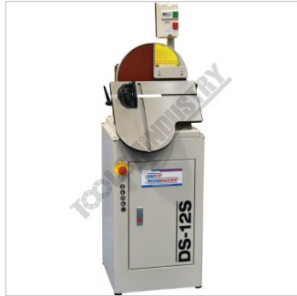
Table Shown Tilted