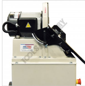
Table Tilted At 45 Degrees