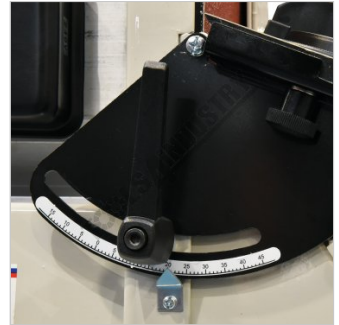
Table Tilted Locking Handle And Scale