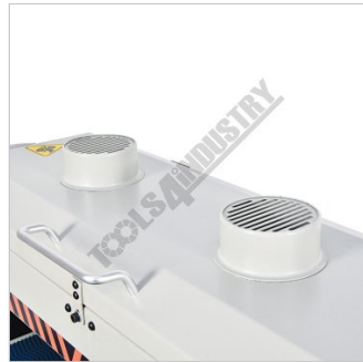
Twin 100mm Dust Ports