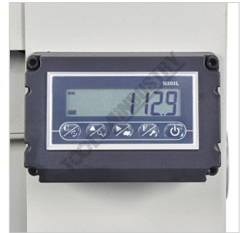
Electronic Height Reader