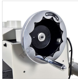
Height Adjustment Handle