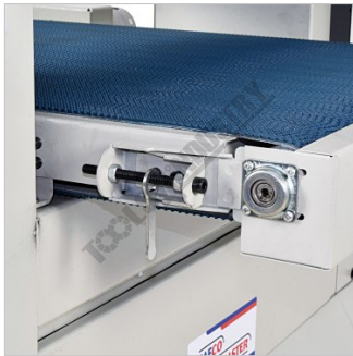
Belt Tension Adjustment