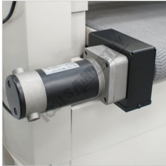
Conveyor Feed Motor