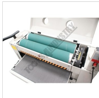
Top Guard Open