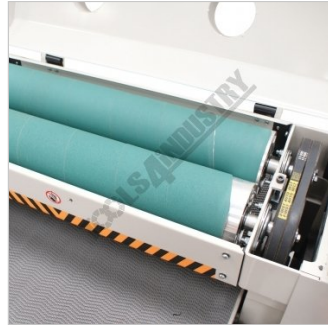
Twin Drum Sanding System