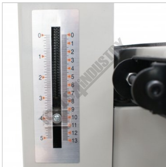
Thickness Height Gauge