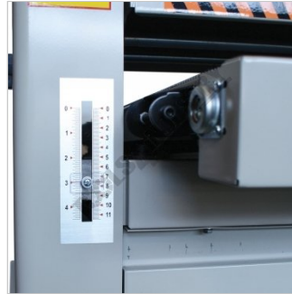
Table Height Gauge