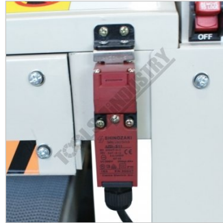
Lid Safety Interlock Switch