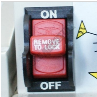
Safety Interlock Switch