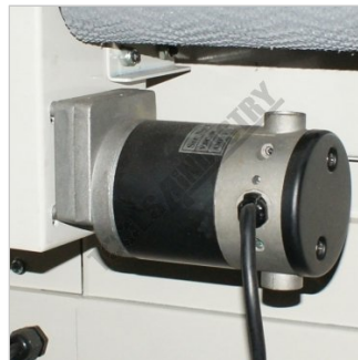
Table Feed Motor