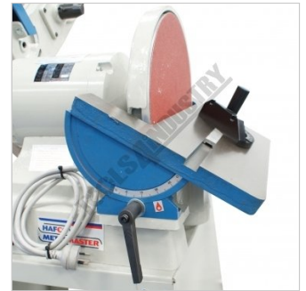
Tilting Table with Mitre Guide