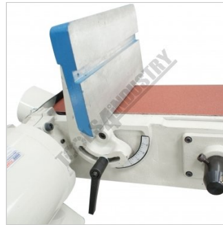
Tilting Table to 45 degrees