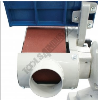
Linishing Belt Dust Chute