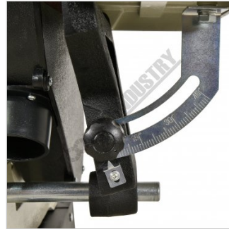
Table Angle Adjustment