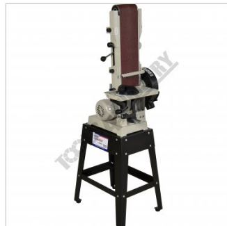
Vertical Linishing Position Left View