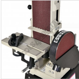
Table and Mitre Guide