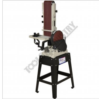
Vertical Linishing Position