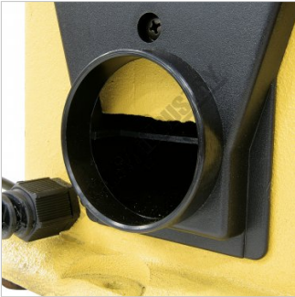
Dust Extraction Port