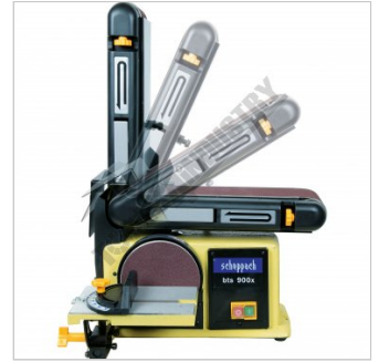
Horizontal to Vertical Linishing