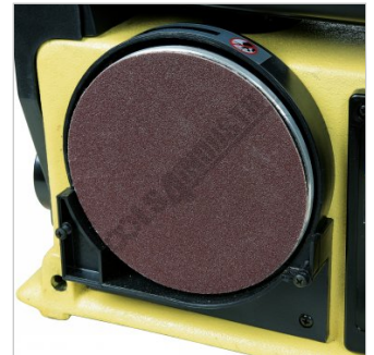
150mm Sanding Disc