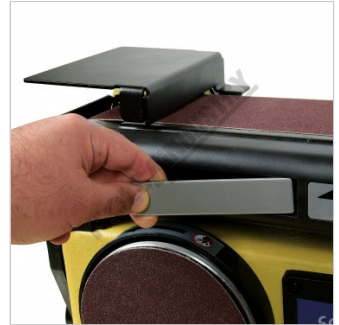
Releasing Tension To Change Belt