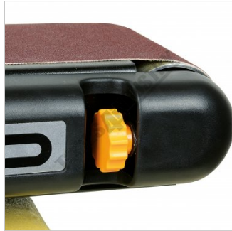
Belt Tracking Adjustment Dial