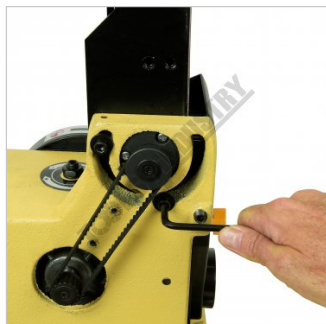
Lock / Unlocking Linishing Head Step 2 - Tighten Or Loosen 2 x Cap Screws