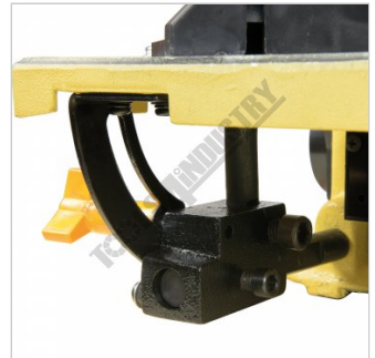
Tilting Table Adjustment Support