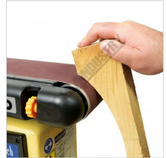
Shown Curved Sanding