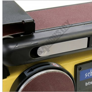
Belt Tension Release Lever