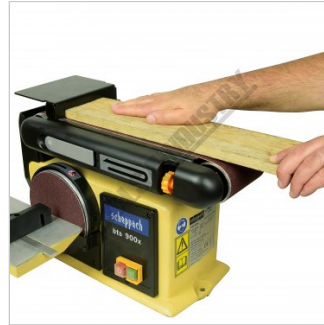
Shown Horizontal Flat Sanding