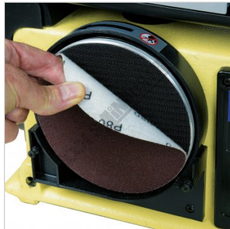
Hook & Loop Backing Pad