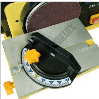
Adjustable Mitre Guide