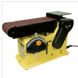
Side View Tool-Storage