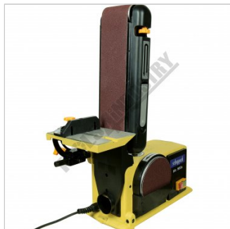
Vertical Belt Linishing with Table & Mitre Guide Full View