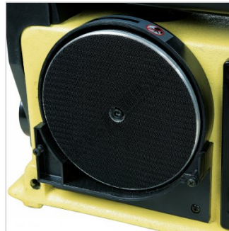
Hook & Loop Backing Pad For Quick Sanding Disc Change