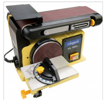
Table Set At 90° Degrees For Disc Sanding