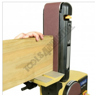
Shown Sanding In Vertical Belt Positioning