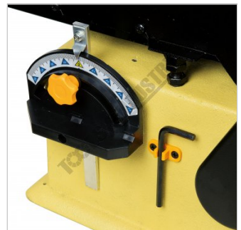
Tool Storage Holders