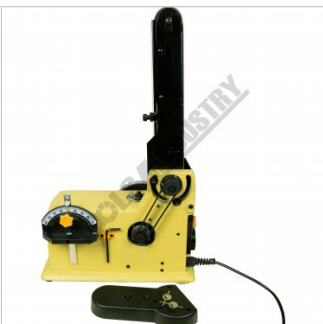
Lock & Unlocking Belt Linisher Head Step 1 - Remove Side Cover