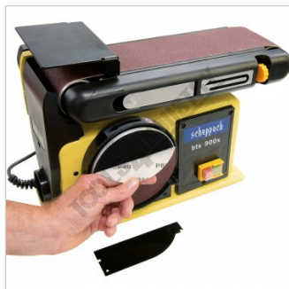
Removing Sanding Disc & Lower Guard