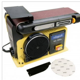
Removed Sanding Disc & Lower Guard