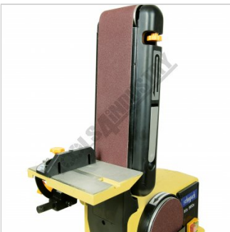
Vertical Belt Linishing with Table & Mitre Guide