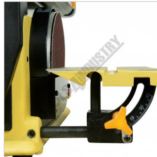
Tilt Table to 45 Degrees