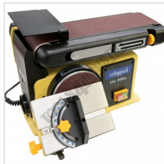
Table Tilted 45° For Disc Sanding