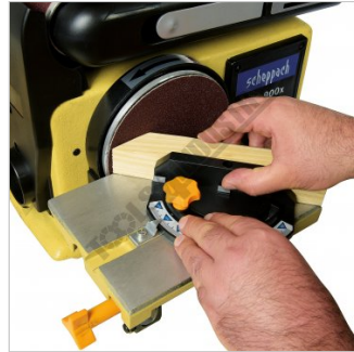
Shown Disc Sanding At 45° with Mitre Guide