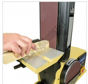
Shown Sanding In Vertical Belt Positioning 2