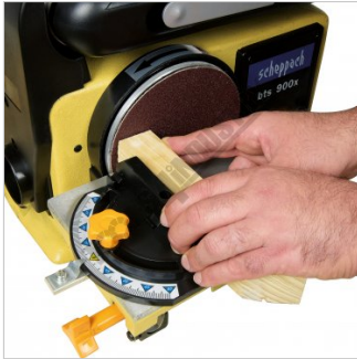
Shown Disc Sanding At 90°