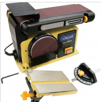
Shown with Table Removed