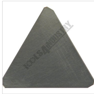
Tip Top View