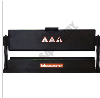
P455 PBA 60 Pressbrake Attachment Suits Hydraulic Presses