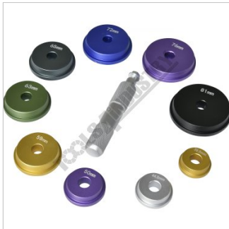
P031 PDS 3BS Bearing Race Seal Driver Set