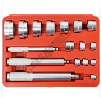
P030 PDS 2B Bush Driver Set