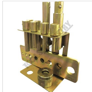
P1401 PPK 20 Steel Press Pin Driver Set 11 piece