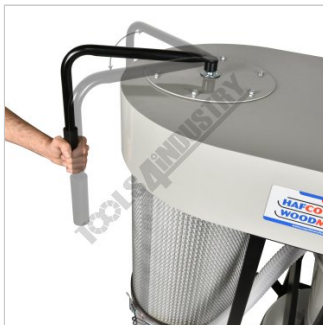
Rotary Hand Filter Cleaning