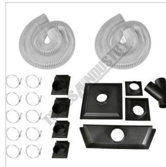
DCK 4 Dust Accessory Kit W344