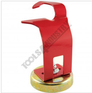
Magnetic Torch Holder