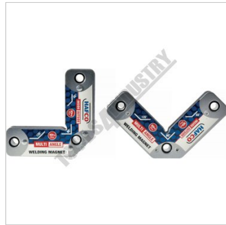
45, 90 & 135 Degree Magnets