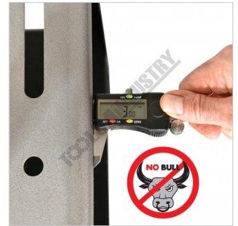
3mm Thick Bench Top