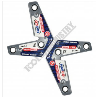
15, 60, 90 & 120 Degree Magnets