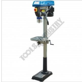
PD-360 Pedestal Drill