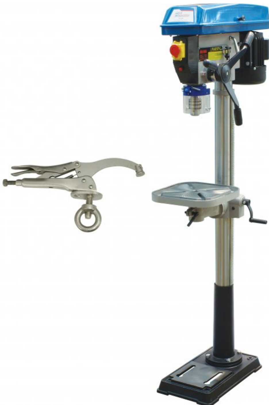
Table Tilts Left & Right To 45° & Rotates 360°

Heavy-Duty Pedestal Drill & Clamp Package Deal