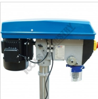
Head Side View