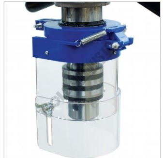
Adjustable Safety Chuck Guard with Flip Up Screen