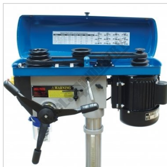
A Section Belt Drive System