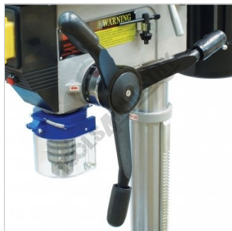
1 Piece Cast Iron Drilling Lever