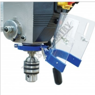
Safety Chuck Guard Flipped Up