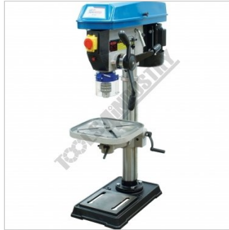
BD-360 Bench Drill