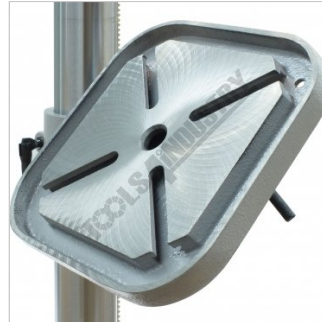
Tilting and Rotating Cast Iron Table