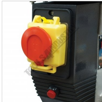
Emergency Stop Switch and Light Switch