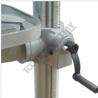
Table Height Adjustment Crank