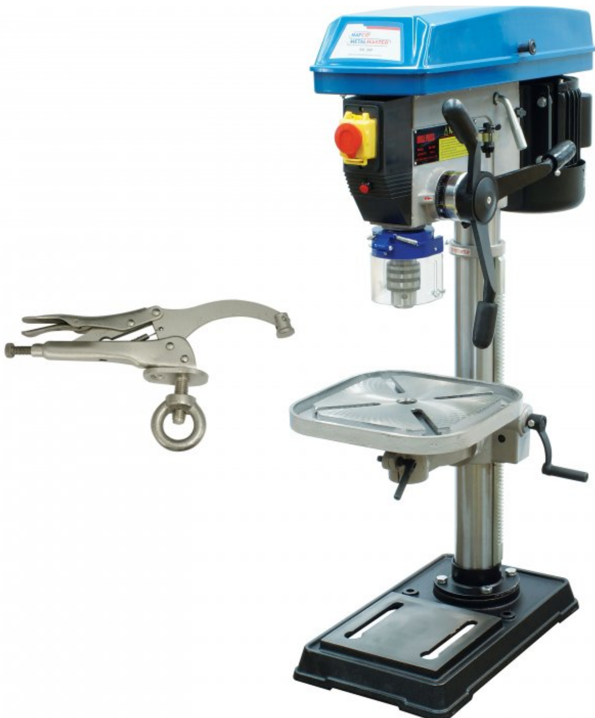
Table Tilts Left & Right To 45° & Rotates 360°

Heavy-Duty Bench Drill & Clamp Package Deal