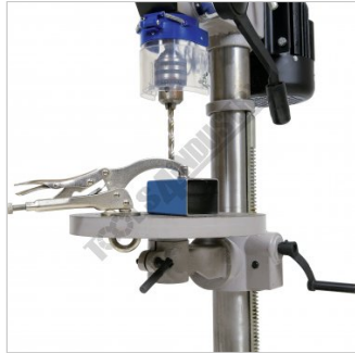
Shown Clamping Job on Drilling Machine