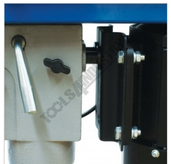
Belt Tension Lever and Lock