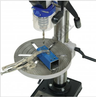
Shown Clamping Job on Drilling Machine