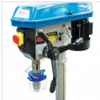
80mm Spindle Travel