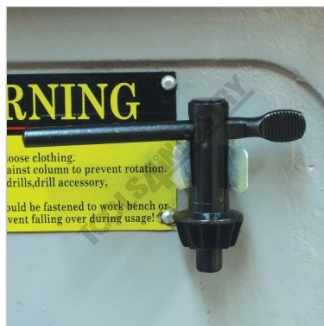
Chuck Key Holder