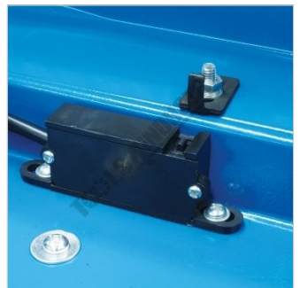
Safety Micro Switch on Pulley Guard