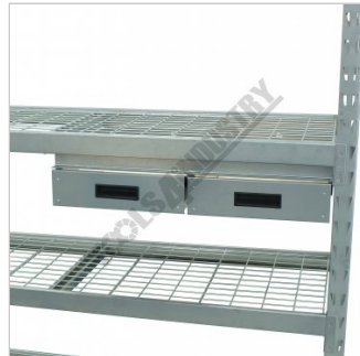
Shown Mounted to Racking with Drawers Closed