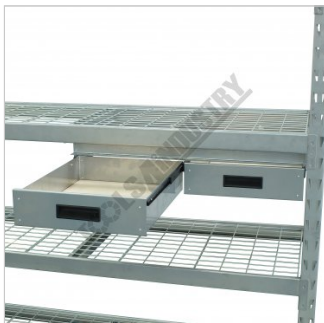
Shown Mounted to Racking with Drawer Open