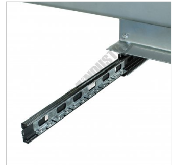
Ball Bearing Slides