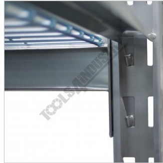
Internal Shelf Locking Wedge Type System