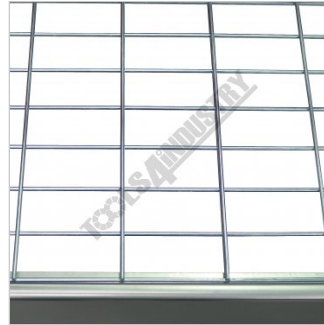
Shelf Wire Mesh