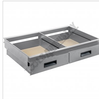
Shown with Drawers Closed