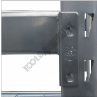
External Shelf Locking System