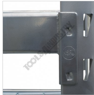
External Shelf Locking System