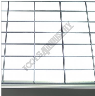
Shelf Wire Mesh