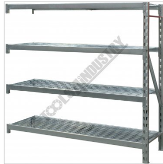
RSS-4WSA - Industrial Steel Shelving Extension