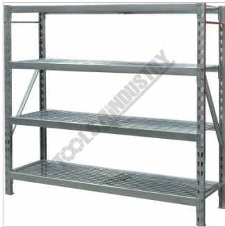
RSS-4WS Industrial Shelving