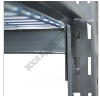
Internal Shelf Locking Wedge Type System