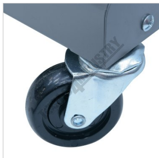
2 x Swivel Wheels