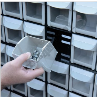
Removable Bins For Easy Access & Refilling