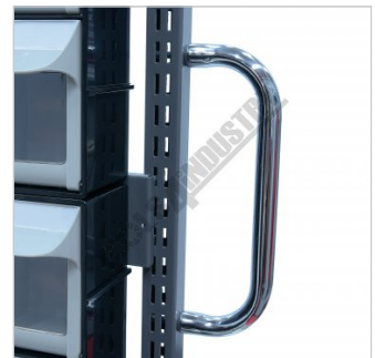
Chrome Handle Mounts on Left or Right Side