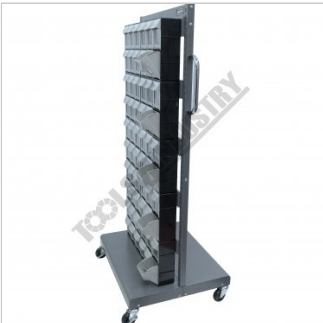
Right Side View Two Buckets Open