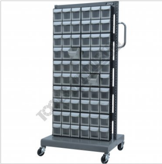
Few Buckets Shown Open