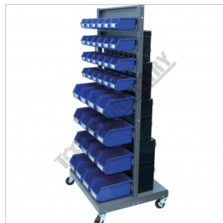
Shown with Optional Buckets A432, A434, A436