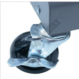
2 x Swivel Wheels with Brake