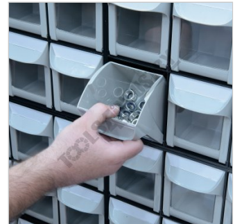
Removable Bins For Easy Access & Refilling