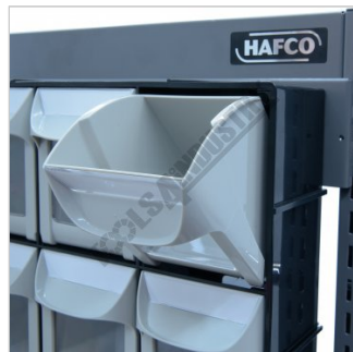
Bin Opened To 40° Angle