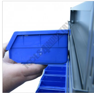
Optional Bucket Shown Clipped Onto Bracket