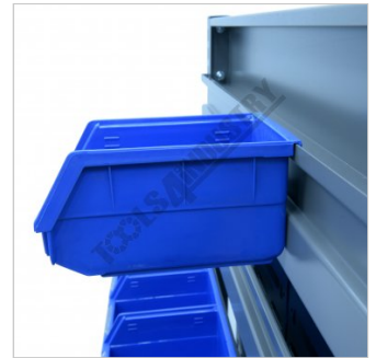
Optional Bucket Shown Clipped Onto Bracket