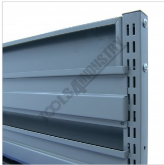
Optional Bracket Securely Clipped Onto Frame