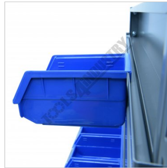
Optional Bucket Shown Clipped Onto Bracket