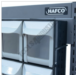
Medium Size Bins