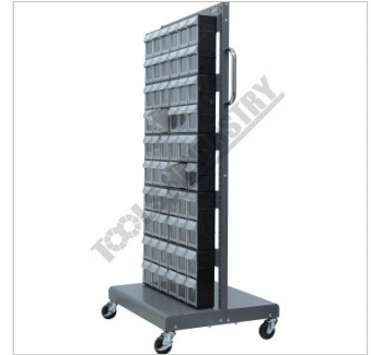
Right Side View Buckets Open