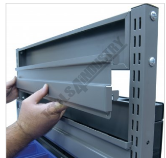
Optional Bracket Shown Clipping Onto Frame