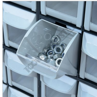
Bins Open Smoothly To a 40° Angle