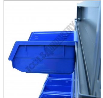
Optional Bucket Shown Clipped Onto Bracket