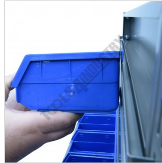
Optional Bucket Shown Clipped Onto Bracket