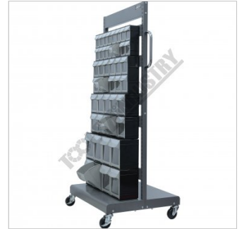
Right Side View Few Buckets Open