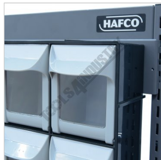
46 x Bins, Small, Medium, Large & Extra Large Sizes