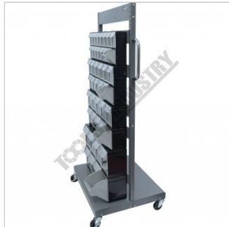
Right Side Top View Buckets Open