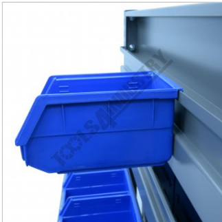
Optional Bucket Shown Clipped Onto Bracket