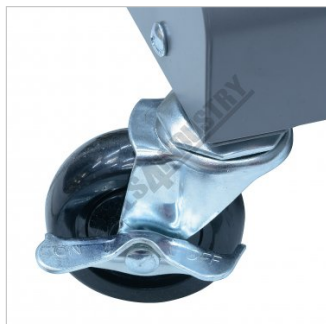
2 x Swivel Wheels with Brake