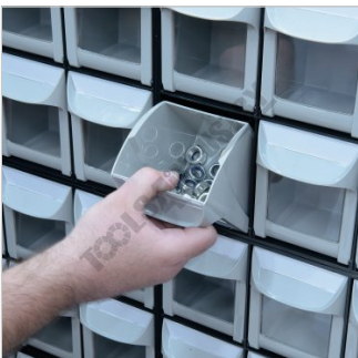
Removable Bins For Easy Access & Refilling