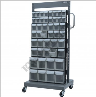
Few Buckets Shown Open