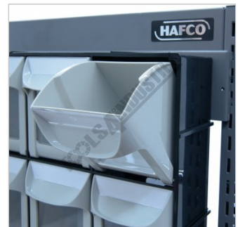
Bin Opened To 40° Angle