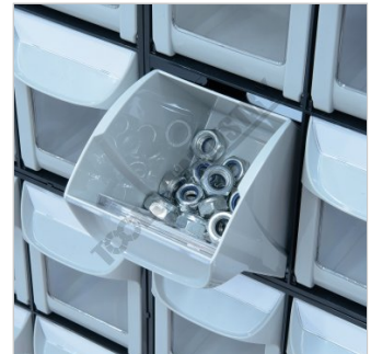
Bins Open Smoothly To a 40° Angle