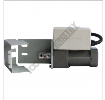
Drive Shaft Coupler Connector