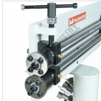
Top Roll Height Adjustment Handle