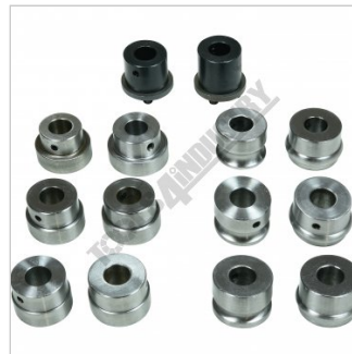
Includes 7 Sets of Dies