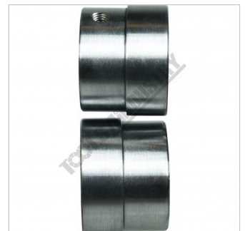
1.16 1.6mm Stepped Dies