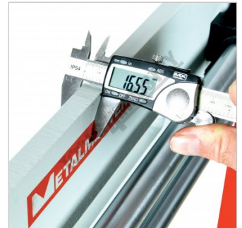
16mm Plate Steel