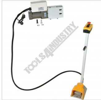
Motor Kit Assembly