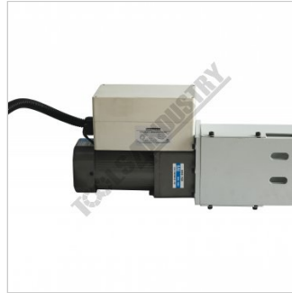
Variable Speed Drive Motor