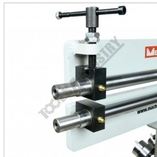
22mm Spigot for Mounting Rollers