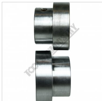
1.4 6.35mm Stepped Dies