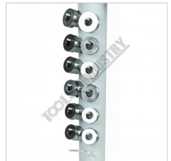
Rolls Stored on Stand