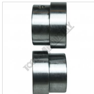
1.8 3mm Stepped Dies