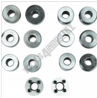
Die Sets Top View