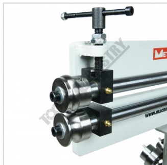
Shown With 1.2.12 Beading Dies