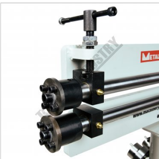
Shown With Shearing Dies