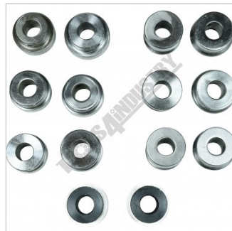
Die Sets Top View 2