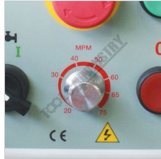
Electronic Variable Speed Dial