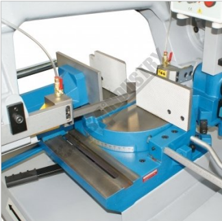
Unique Rotating Table and Dual Mitre Swivel Head