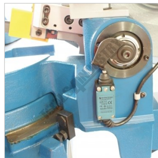
Blade Height Micro