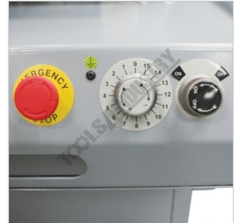
Adjustable Automatic Feed