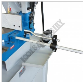
Adjustable Length Stop