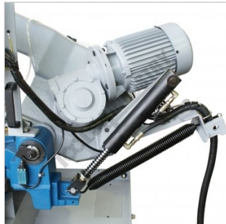
Motor and Gearbox Drive