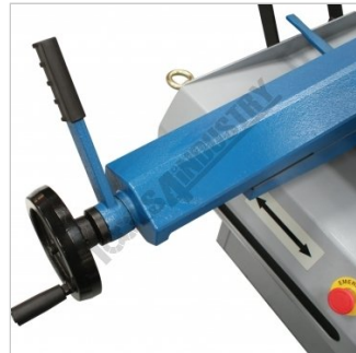
Quick Action Clamp Lever