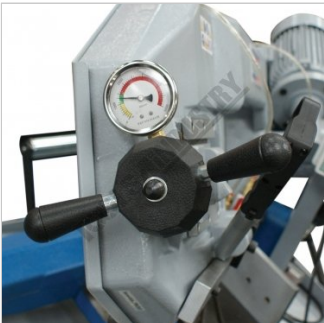
Blade Tension Gauge