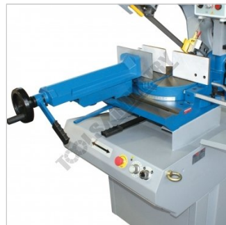
Sliding Vice with Quick Action Lock