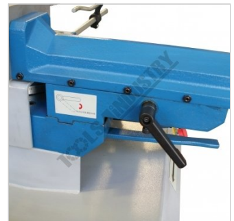
Quick Action Clamping Lever