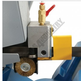
Wire Wheel and Roller Bearing Blade Guides