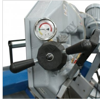
Blade Tension Gauge