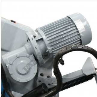
Motor and Gearbox Drive