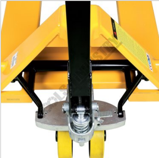
Rear Frame with Extra Cross Members for Additional Strength