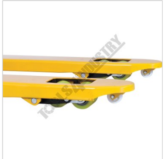
Dual Front Wheels Lowered