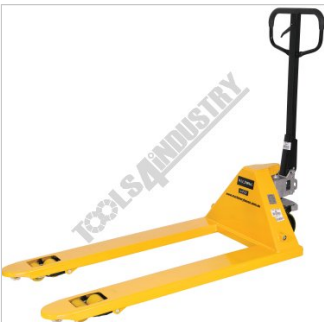
Side View Lowered