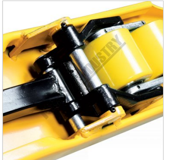
Front Wheel Hinge Reinforced Welded Bracket