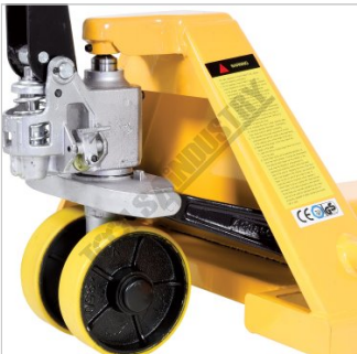
Large Double Rear Wheels