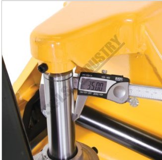
Large 35mm Diameter Piston Lifting Ram