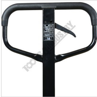
Handle In Engaged Ram Position