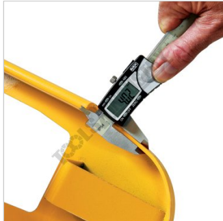
Channel Thickness 4mm