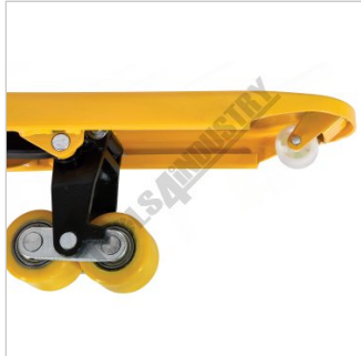
Front Wheel For Easy Pallet Entry