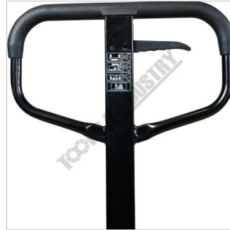
Handle In Neutral Position