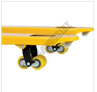
Front Entry Wheels Raised