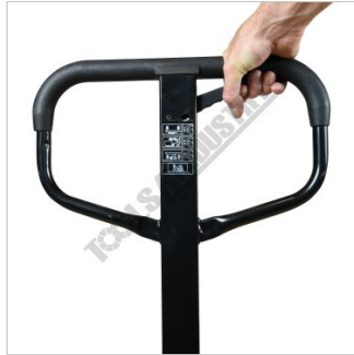
Handle In Release Position