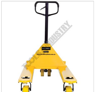
Front View Raised