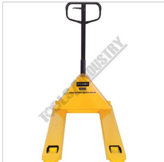
Front Entry View