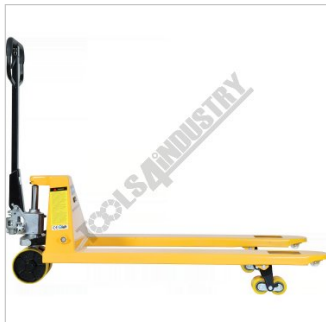
Side View Raised