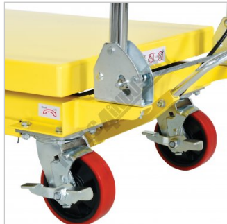
2 Swivel Brake Wheels