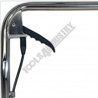
Table Lowering Lever