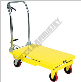
Lowest Table Position