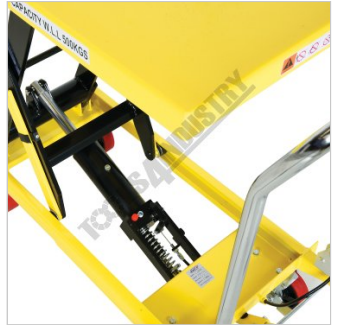
Hydraulic Lifter Ram