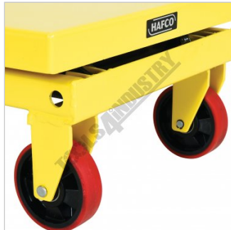
2 Fixed Wheels