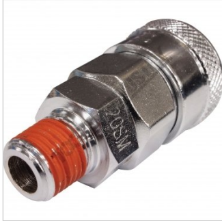
1/4" BSP Male End