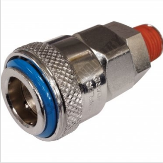
One Touch Hi Flow Coupling