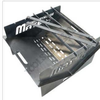
Removable Grill Bars