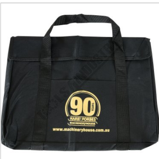
Heavy Duty Canvas Carry Bag