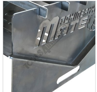
Plates Slide Into Each Other