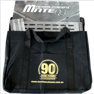
Easy Flat Pack Storage