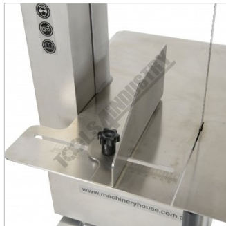
Length Stop Guide