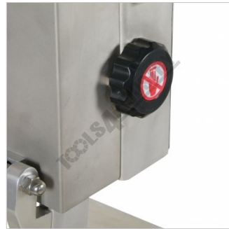
Blade Guard Door Handle