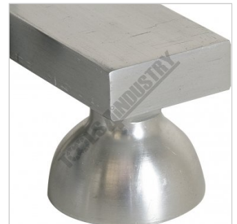
Stainless Steel Feet