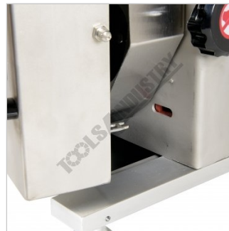
Safety Micro on Blade Guard