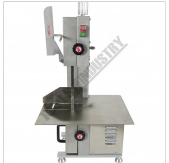
Side View Guard Up