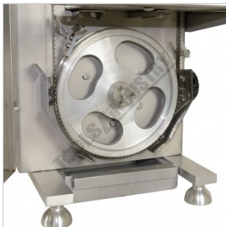
Bottom Blade Wheel