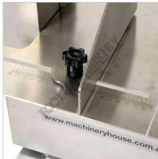
Length Stop Graduations