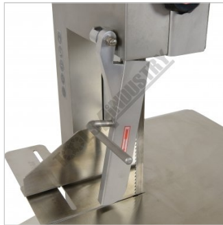
Blade Guard Down