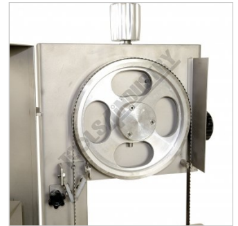
Top Blade Wheel