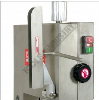
Blade Guard Up