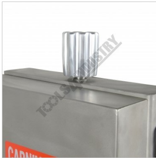
Blade Tension Handle