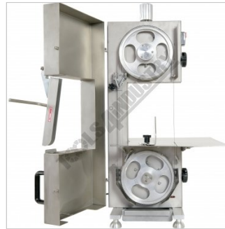
Side View With Blade Guard Open