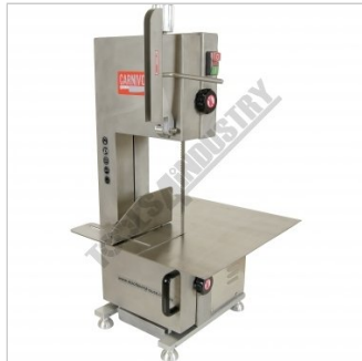
Top View Guard Up