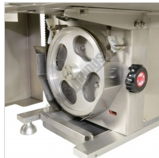
Bottom Blade Wheel Setup