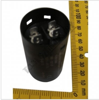
EC216 CAPACITOR 189 227uF 125V START