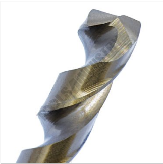
135 Degree Split Point M35 Grade HSS 5% Cobalt