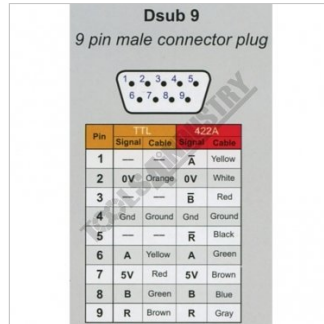
Dsub9 Wiring Diagram