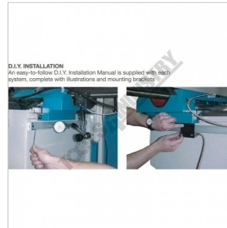
D.I.Y. INSTALLATION An easy-to-follow D.I.Y. Installation Manual is supplied with each system, complete with illustrations and mounting brackets.