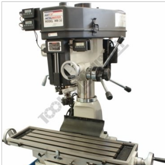
Multiple Axis shown Setup Up on Mill