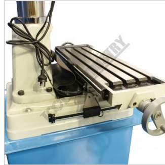
X and Y Axis Scales