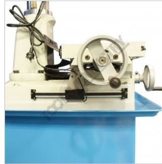
Y Axis Scale