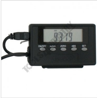
Digital Display Unit