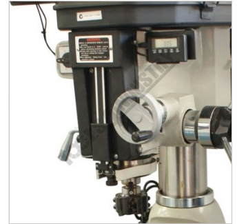
Z Axis Scale