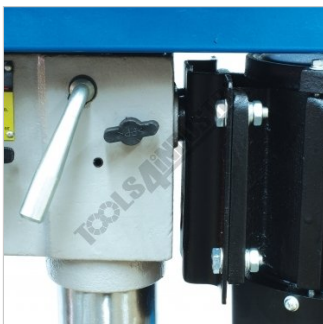
Belt Tension Lever and Lock