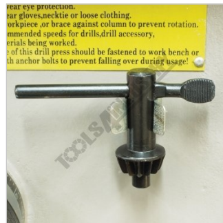
Chuck Key Holder