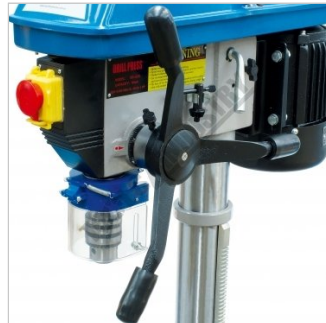
1 Piece Cast Iron Drilling Lever