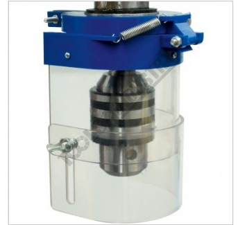
Adjustable Safety Chuck Guard With Flip Up Screen