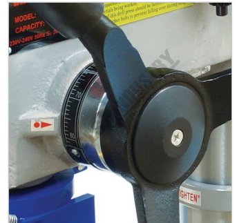
Drilling Depth Stop Setting With Scale