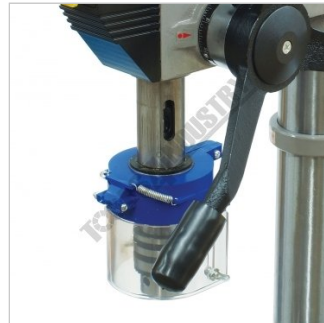
80mm Spindle Travel