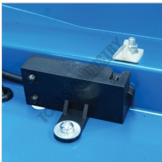
Safety Micro Switch on Pulley Guard