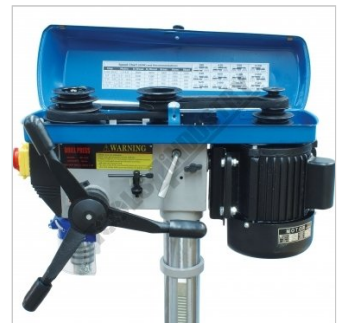
A Section Belt Drive System