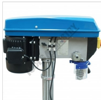
Head Side View