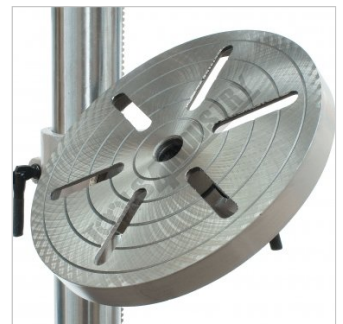
Tilting and Rotating Cast Iron Table