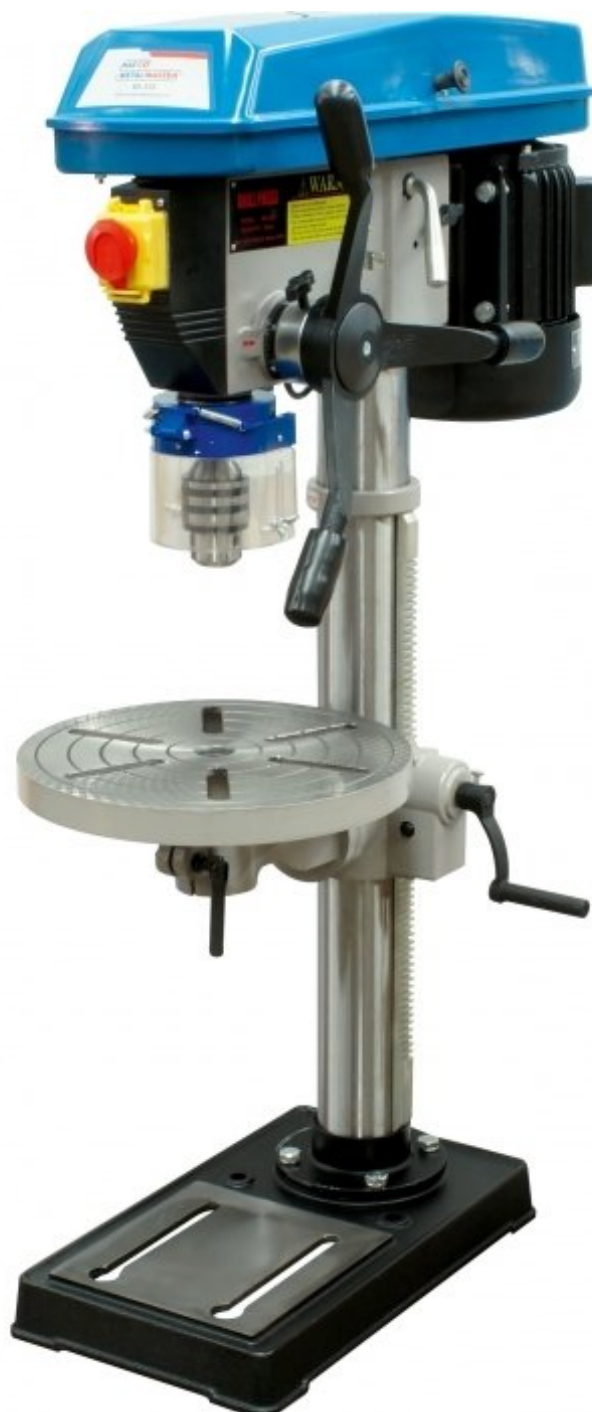
Table Tilts Left & Right To 45° & Rotates 360°