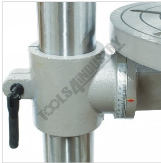
Tilt Table Scale