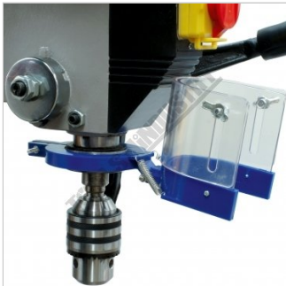
Safety Chuck Guard Flipped Up