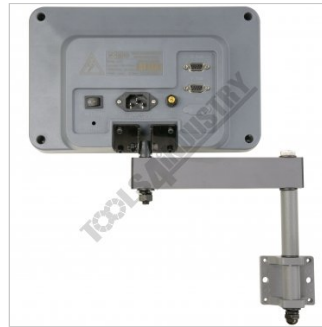
Shown Mounted to Optional DRO Rear View