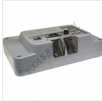
Brackets Mounted with Optional Screws