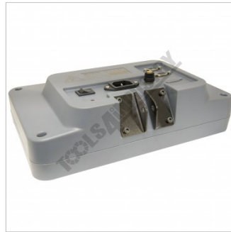
Brackets Mounted with Optional Screws