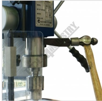
Drill Chuck Being Removed by Drill Drift