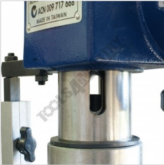
Drill Chuck Set Up For Removal