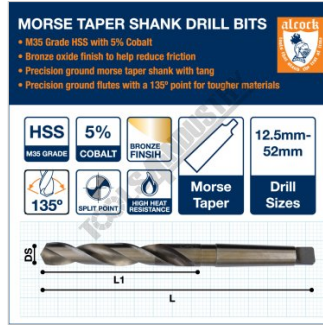
Morse Taper Shank Drill