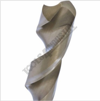
135 Degree Split Point M35 HSS 5% Cobalt