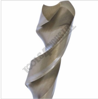
135 Degree Split Point M35 HSS 5% Cobalt