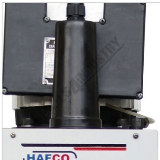
Drawbar for Milling