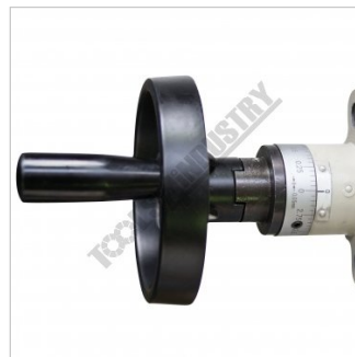
Table Longitudinal Travel Handle