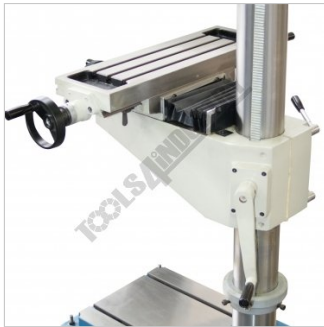
Rack and Pinion Wind Up Table