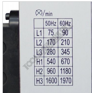
6 Drill Speeds from 75 to 1600rpm