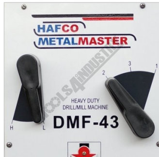
Gear Selection Levers