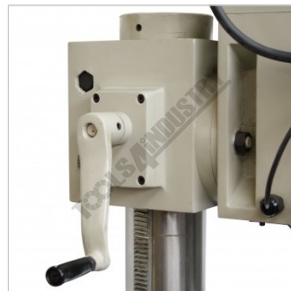
Rack and Pinion Wind Up Table