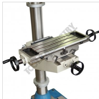
T Slotted Work Table