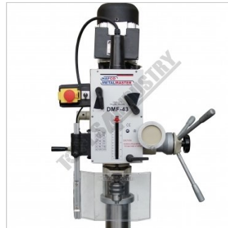
Head Full View