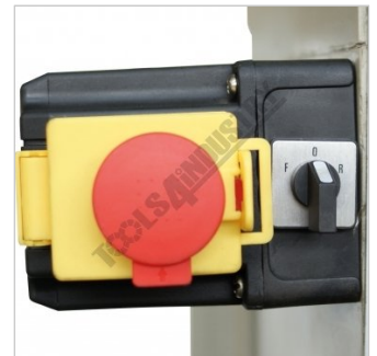
Emergency Stop Switch and Overload Protection