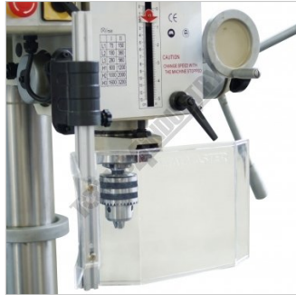
Safety Chuck Guard