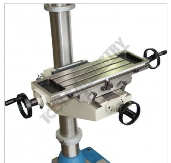
T Slotted Work Table