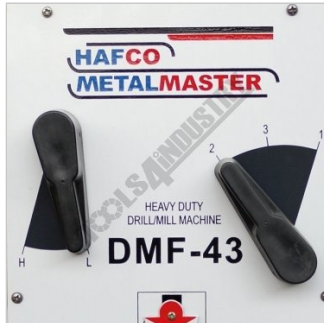
Gear Selection Levers