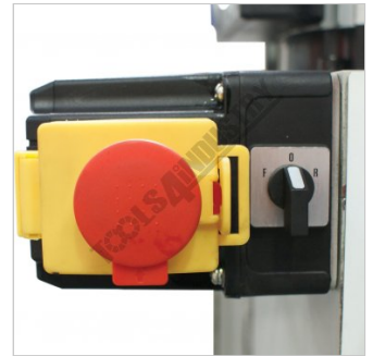
Emergency Stop Switch and Overload Protection