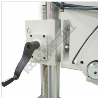
Rack and Pinion Wind Up Drill Head