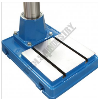
T Slotted Base