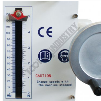
Adjustable Accurate Depth Setting For Increased Productivity