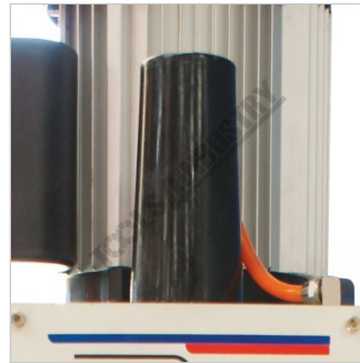
Draw Bar for Milling