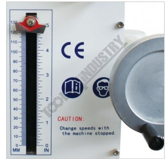
Adjustable Accurate Depth Setting For Increased Productivity