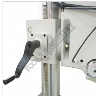
Rack and Pinion Wind Up Drill Head