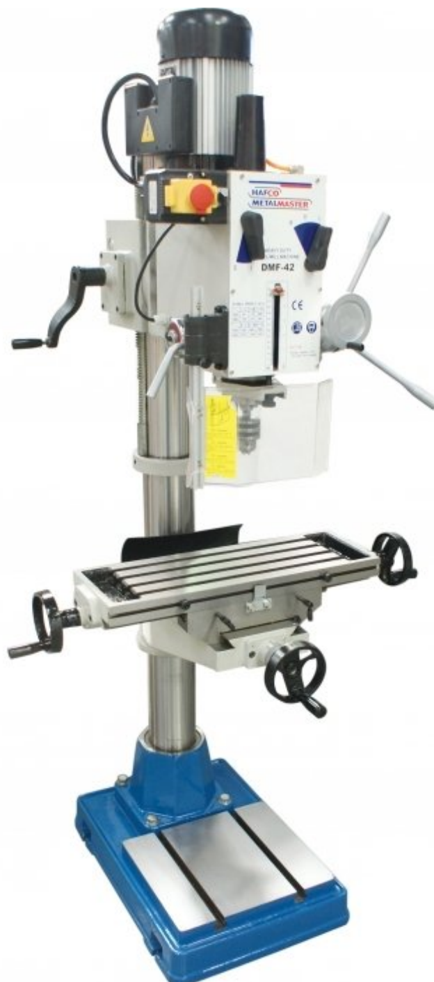
Table Travel: (X) - 370mm (Y) - 175mm (Z) - 780mm

Pedestal Mill Drill - Geared & Tilting Head