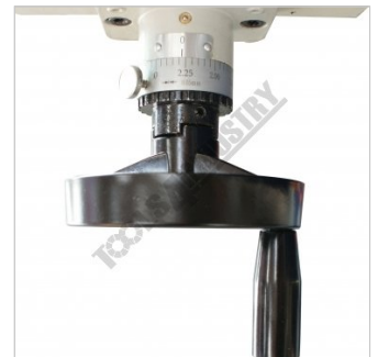
Table Cross Travel Handle