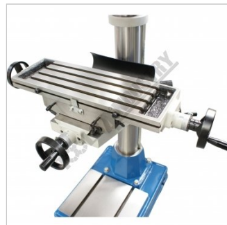
T Slotted Work Table