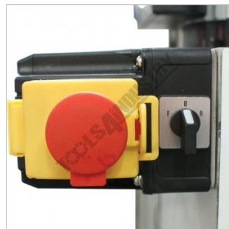
Forward / Reverse & Emergency Stop Switch