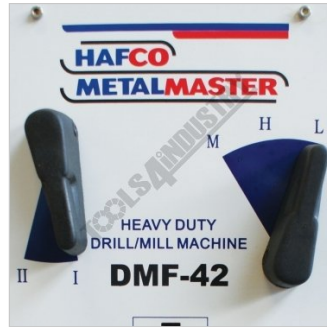
Gear Selection Levers