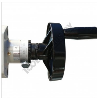
Table Longitudinal Travel Handle