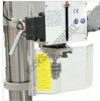
Swivel Safety Drilling Chuck Guard