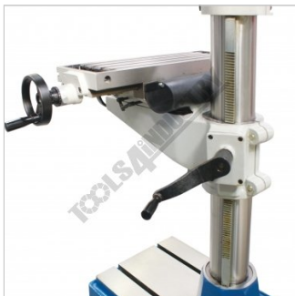
Rack and Pinion Wind Up Table