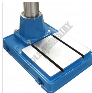
T Slotted Base