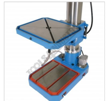
T Slotted Table and Base