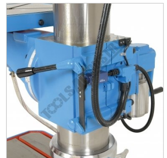
Table Lock with Micro