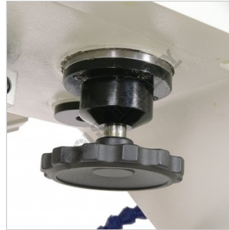
Fine Feed Drilling Dial