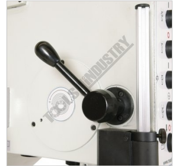
Quill Locking Handle