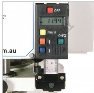
Digital Readout For Drill Depth