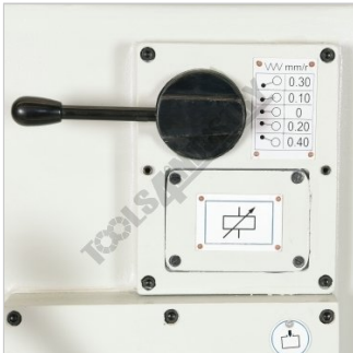
Drill Feed Lever