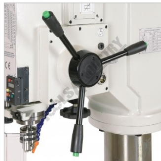
Quill Handle with Auto Feed Buttons