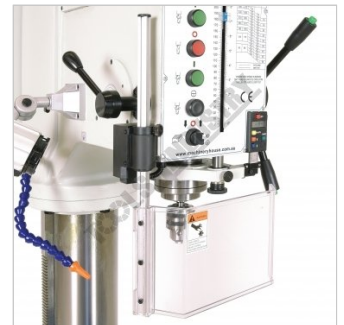
Interlocked Spindle Safety Guard