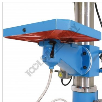
Work Table Rotates and Swivels