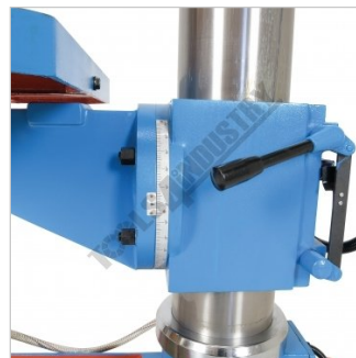
Tilting Table Scale