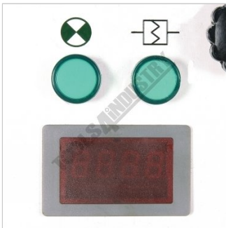
Digital Spindle Speed Display