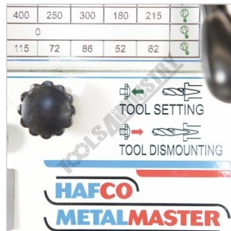
Tool Setting Dismounting