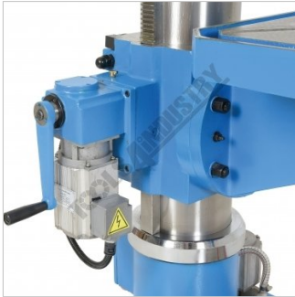
Motorised Table Height with Manual Handle