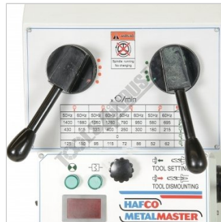
Drill Speed Selection Levers & Speed Chart