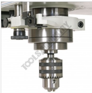
Keyed Drill Chuck