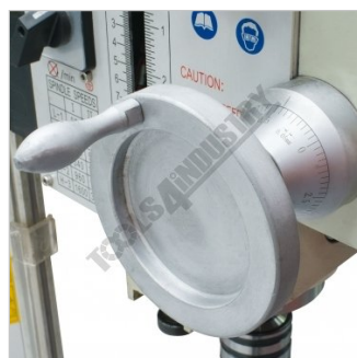
Quill Fine Feed Hand Wheel