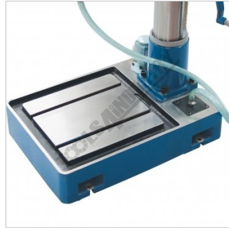
Base with Coolant System