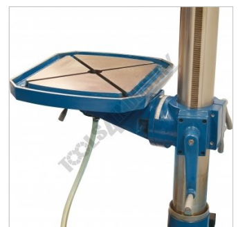
Tilting and Swiveling Table