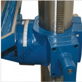
Table with Rack and Pinion Wind Up Handle