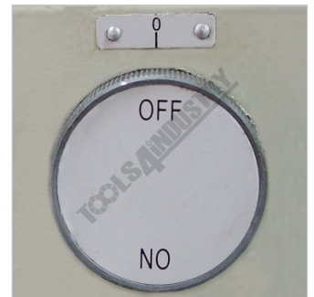
Feed Engagement Dial