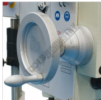
Quill Fine Feed Hand Wheel