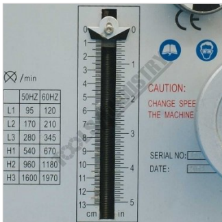
Quill Height Gauge