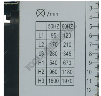
Spindle Speed Chart