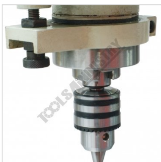
13 Drill Chuck