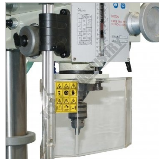
Safety Chuck Guard