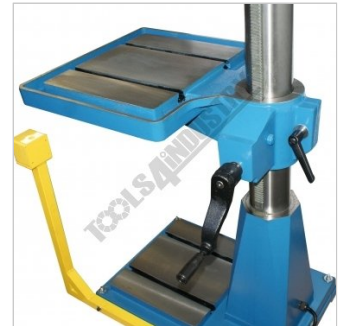
Rack and Pinion Table Adjustment