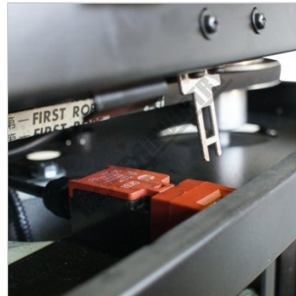
Micro Switch on Belt Cover