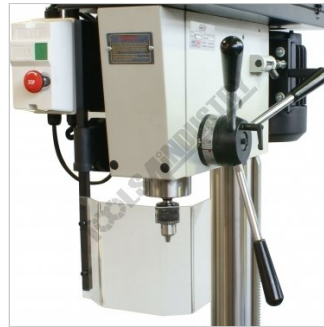
Safety Chuck Guard Quill Handle