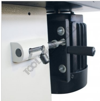
Belt Tension Adjustment