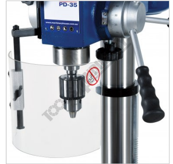
Drill Chuck Safety Guard With Micro Switch