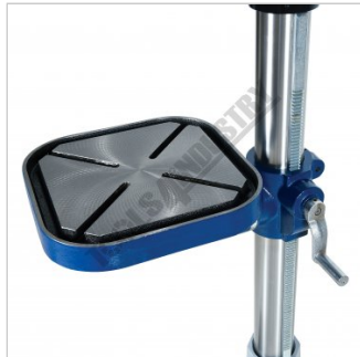
Table Rack Pinion Wind Up