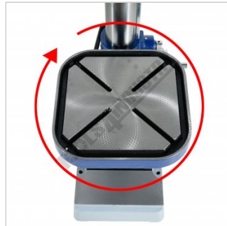
Cast Iron Table Rotates 360 Degree