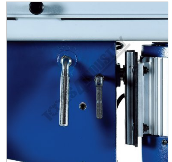
Belt Tension & Lock Lever