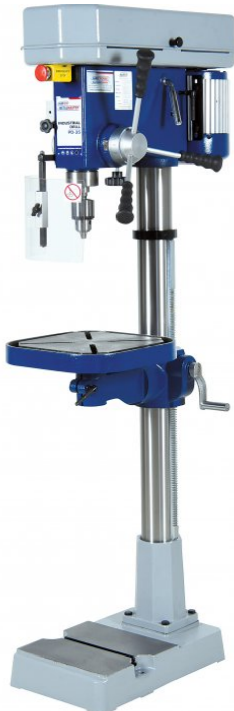
Table rotates 360°