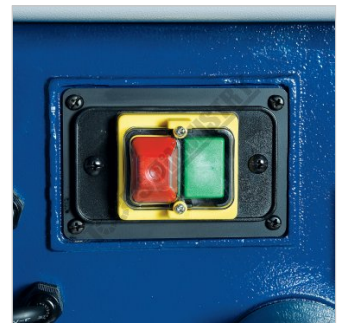
ON / OFF Power Switch