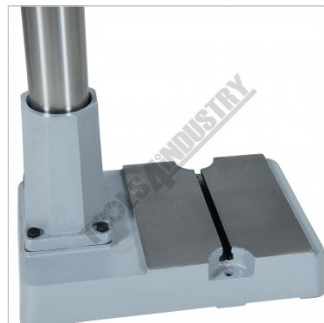
Heavy Duty Base with T Slot