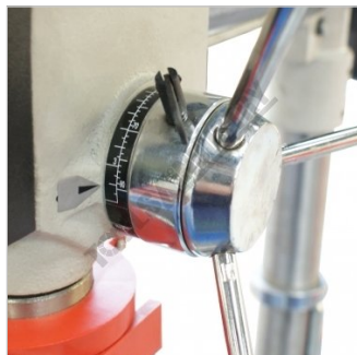
Quill Depth Setting