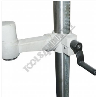
Table Height Adjustment Handle