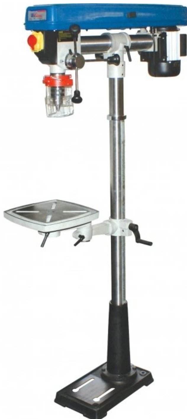
Table Rotates 360°