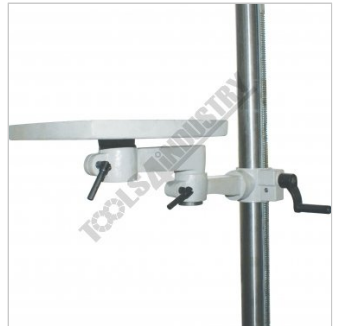
Table Position Locks