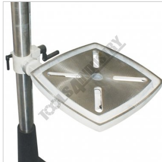
Slotted Square Table