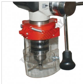
Adjustable Safety Chuck Guard with Flip Up Screen