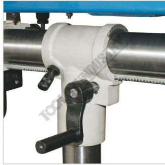
Radial Arm Horizontal Movement and Angle Setting