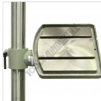
Tilting and Rotating Cast Iron Table