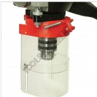
Adjustable Safety Chuck Guard With Flip Up Screen