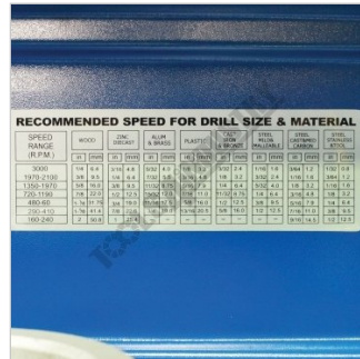
Recommended Speed For Drill Size and Material