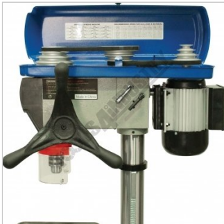
Side View of Head