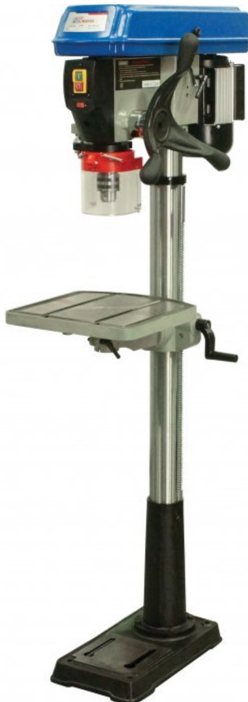
Table Tilts Left & Right To 45° & Rotates