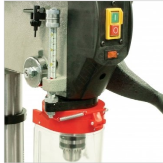
Drilling Depth Stop Setting with Scale