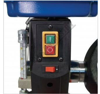
Magnetic Switch and Light Switch