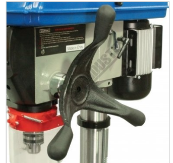
1 Piece Cast Iron Drilling Lever