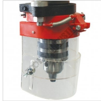
Adjustable Safety Chuck Guard with Flip Up Screen