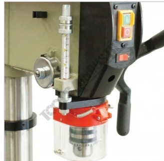
Drilling Depth Stop Setting with Scale