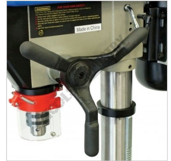
1 Piece Cast Iron Drilling Lever