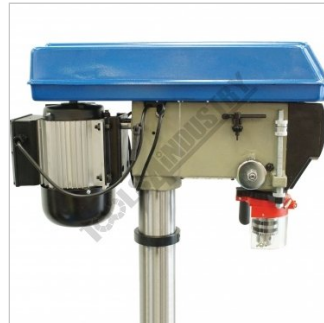
Head Side View