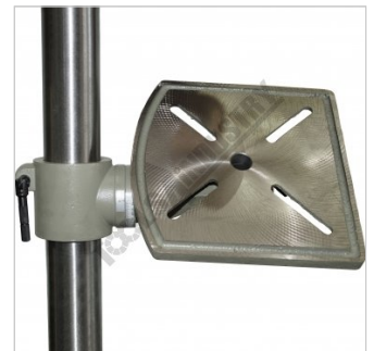
Tilting and Rotating Cast Iron Table