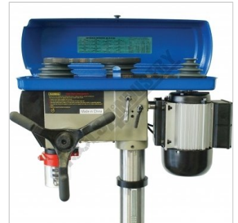
Side View of Head