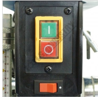
Magnetic Switch and Light Switch