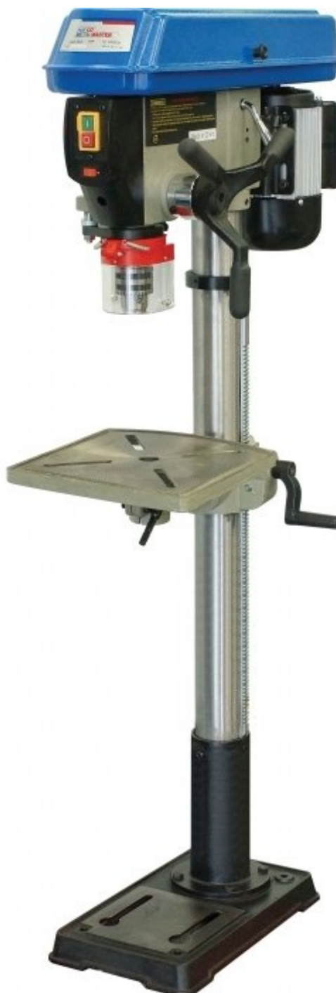
Table Tilts Left & Right To 45° & Rotates