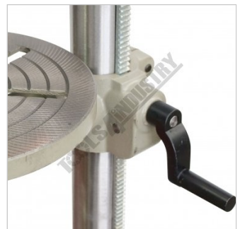
Rack and Pinion Wind Up Table