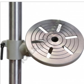
Tilting and Rotating Cast Iron Table