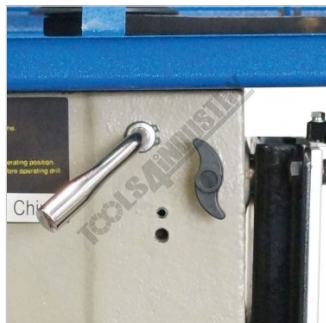
Belt Tension Lever and Lock