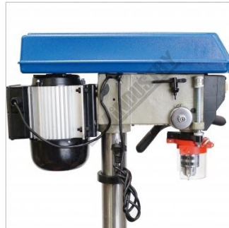
Head Side View