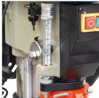
Drilling Depth Stop Setting with Scale