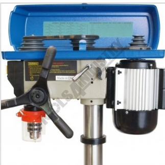
M Section Belt Drive System