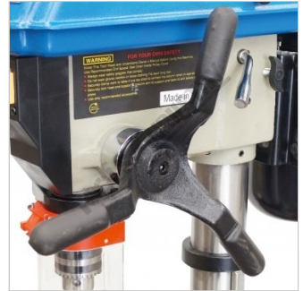
1 Piece Cast Iron Drilling Lever