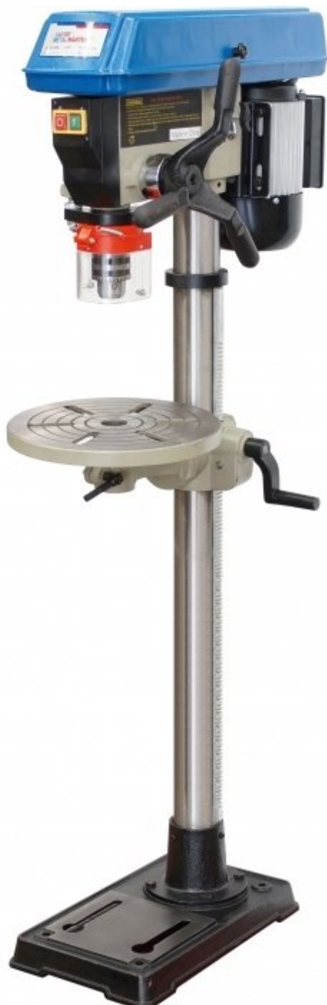
Table Tilts Left & Right To 45° & Rotates 360°