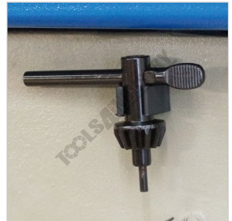
Chuck Key Holder