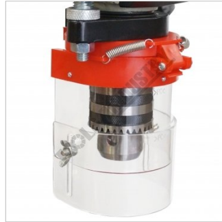
Adjustable Safety Chuck Guard with Flip Up Screen